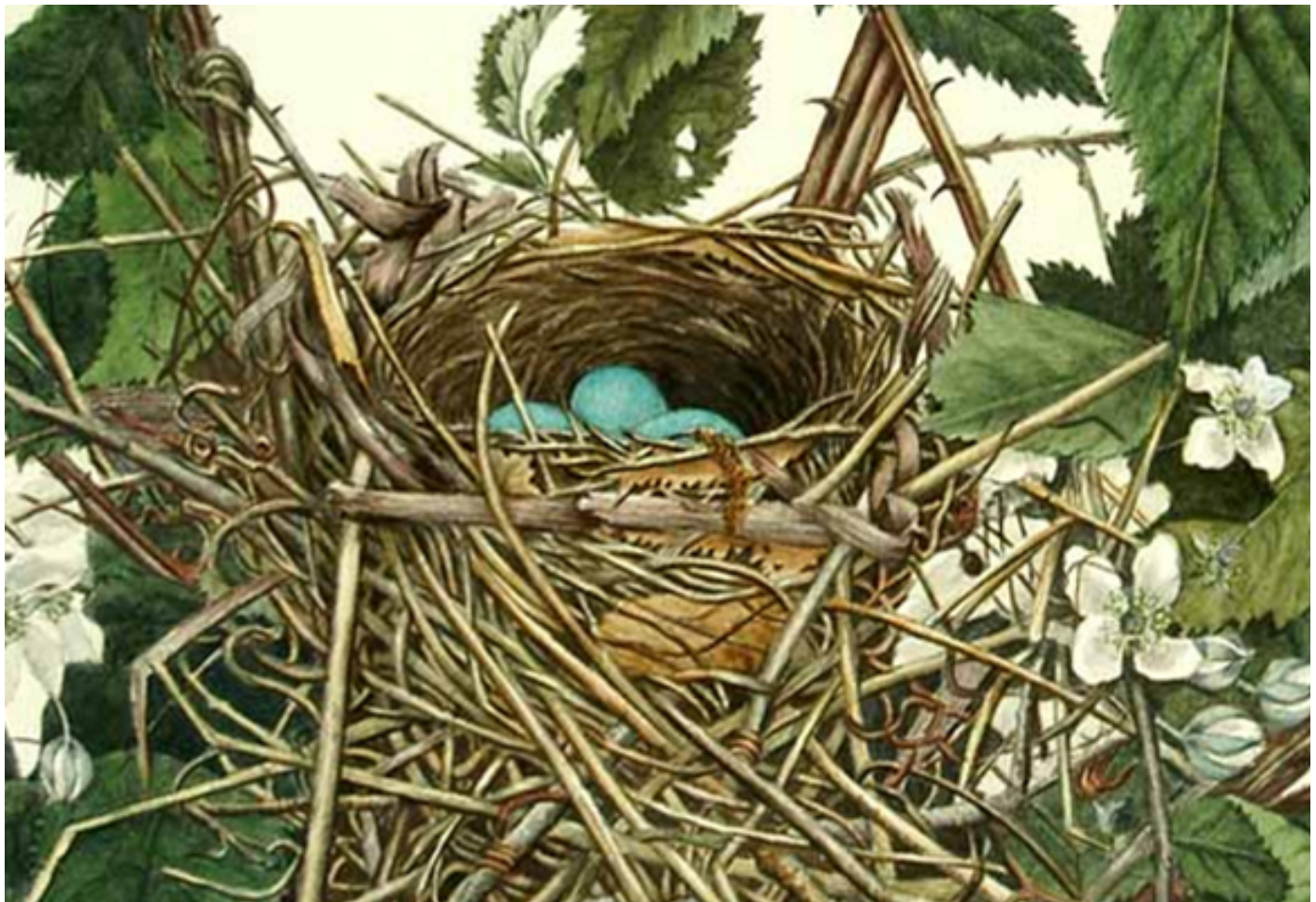
Nest illustrations from Illustrations of Nests and Eggs of Birds of Ohio , by Genevieve Estelle Jones (1886).