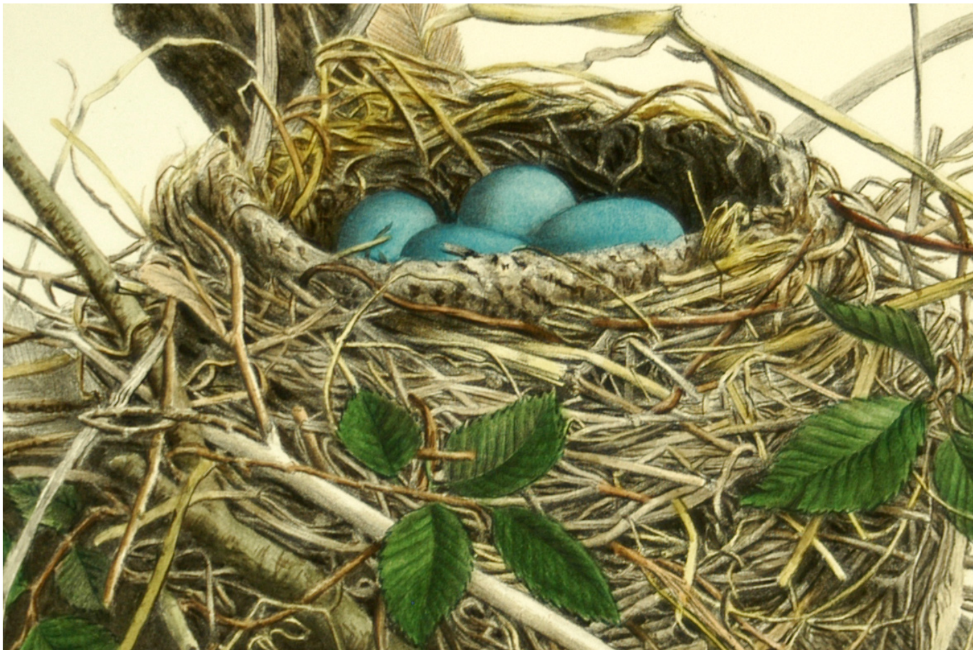
Nest illustrations from Illustrations of Nests and Eggs of Birds of Ohio , by Genevieve Estelle Jones (1886).